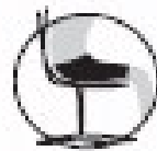
seat pan depth 500