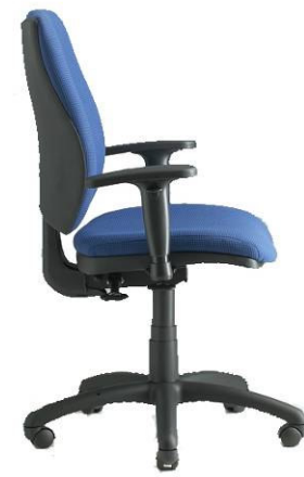
High back with arms