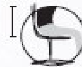
back rest height 440 – 540 (HB)