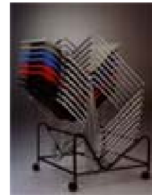
Optional stackable trolley