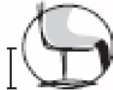
seat height 440