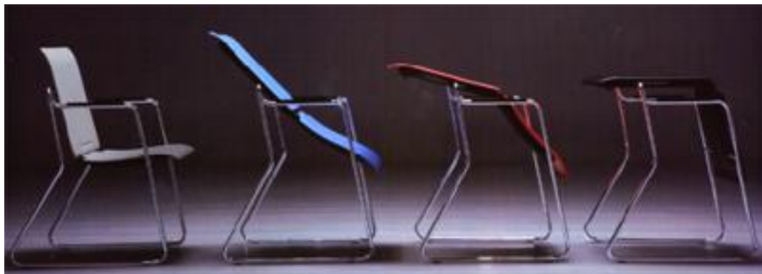
Table width 530