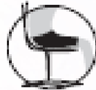
seat pan depth 420