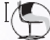
back rest height 470